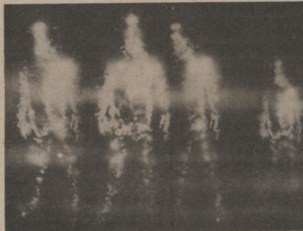
ALIEN VISITORS: "There were four in all — I waved and one of the figures did the same"

like someone trying to talk, but I couldn't make anything from it," he says.